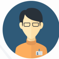
Chief Technology Officer