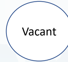
Chief Information Officer