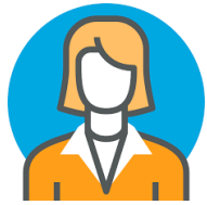
Chief Information Officer