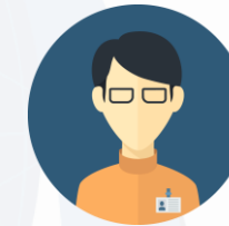
Chief Technology Officer