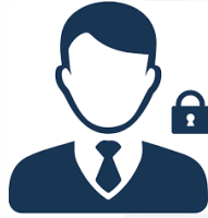
Chief Security/Risk Officer